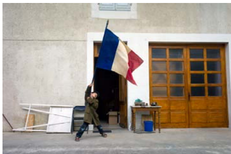
The French # 4

The festival will also present the first ever International Street Photography Award , alongside a student category, celebrating the best work undertaken today from thousands of submissions received from around the world.