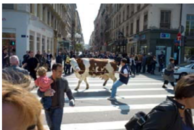
The French, 3