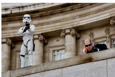
London, 2007

The festival confirms additional venues and artists regularly. For the latest programme information visit www.londonstreetphotographyfestival.org/diary