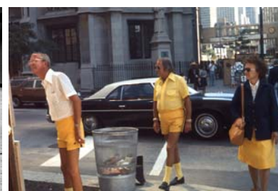
August 1975 © Vivian Maier