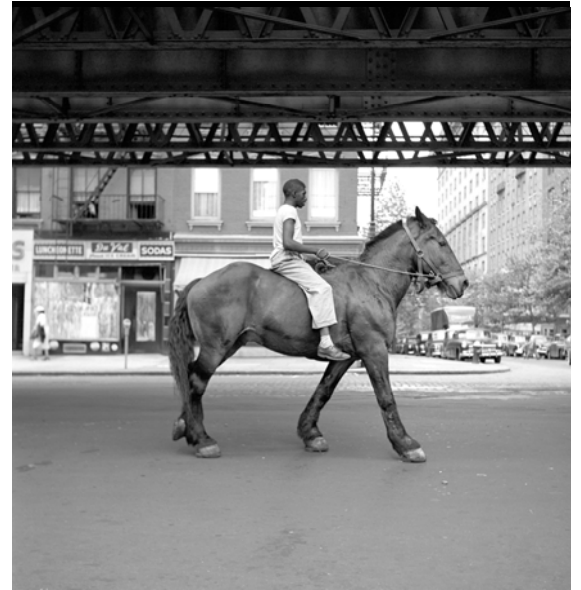
August 11, 1954, New York, NY

World-class photography takes over London's most celebrated venues, large and small, for the festival's inaugural year.