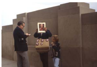
October 1979 © Vivian Maier

Chicago nanny Vivian Maier died in 2009, leaving behind an incredible archive of over 100,000 negatives, prints, and home-made films only discovered shortly before her death.