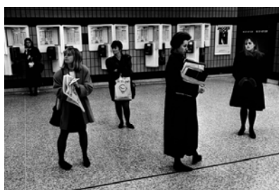
Fenchurch Street