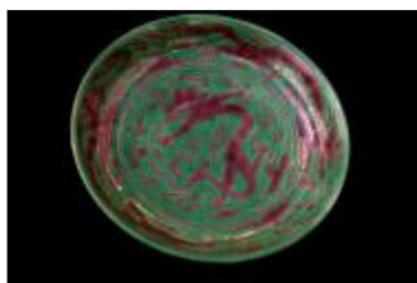
Kangxi bowl, Vandervén & Vandervén Oriental Art