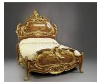
Linke bed, French, 1900, Adrian Alan