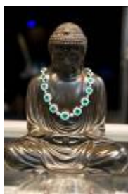
Emerald & diamond necklace, c1918, Greens of Cheltenham