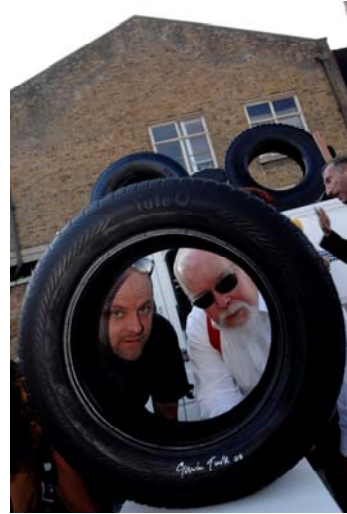
Gavin Turk and Sir Peter Blake

“The hippest car boot sale you’re likely to come across in quite a while” The Independent “Hang out with some of the best contemporary British artists and pick up a few bargain buys to boot” Sunday Times, Style “Expect the unexpected at this off-the-wall event” Time Out