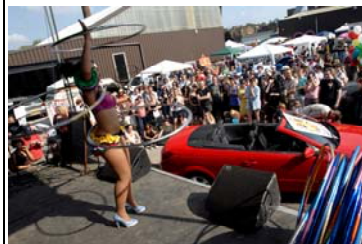
Entertaining the crowds on the Booty Stage