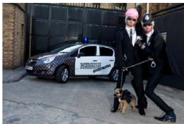
Rubbish Fashion Police