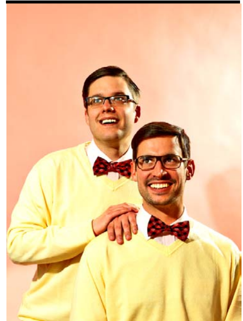
Sunday Defensive headline London's biggest anti-valentines stand-up spectacular

-Taking place Thursday February 11 th -Doors open at 7pm