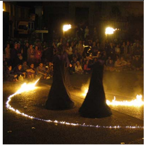
Le Snob