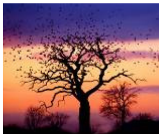
Starlings in the Old Oak Tree, Wild Amateur

The photographs from the 11 runners-up represent a genuine snapshot of the natural beauty and historic landmark sites that make up Britain. Ranging from the impressive, cloud-like formation of a flock of Starlings, to the iridescent reflections of Perranporth beach, the winning entries convey a diverse range of views and outlooks across Britain. The runners-up will also receive prizes from DK Eyewitness and the competition partners Photobox, the Landmark Trust and Waterstone's. Email marketing@traveldk.com for full shortlist and exhibition details.