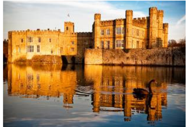
Leeds Castle, Heritage Amateur Category