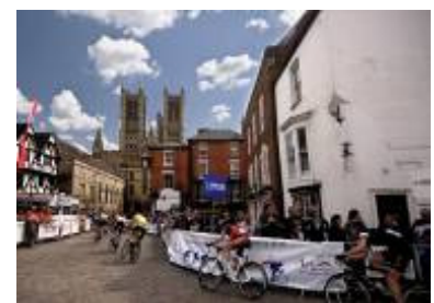
Cycle Race in Lincoln, Iconic under 16