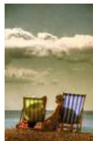
Deckchairs, Iconic Amateur