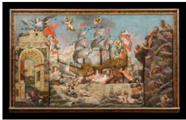
18 th century panel representing an allegory of the Hapsburg dynasty, Carlton Hobbs