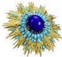
Yellow Gold "Textured Wire" brooch set with lapis lazuli, turquoise and diamonds. London Hallmarks 1967 Grima

Stunning jewellery from antiquity to the present day will be on show at the fair. The renowned Swiss exhibitor Grima , who has designed jewellery for The Queen, Jackie Kennedy and Marc Jacobs to name a few, will display a diverse selection of pieces from the sixties and seventies up to the present day.