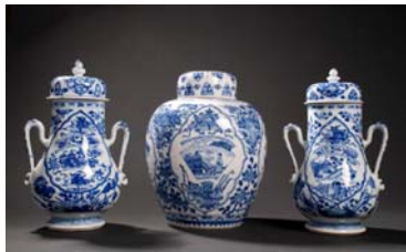
Kangxi period (1662-1722)