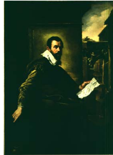
Portrait of a Man Seated Holding a Sheet of Music by Domenico Feti From the Castle Howard loan exhibition

From Old Masters to mid-century modern, evocative photographic prints to world renowned furniture makers, the Olympia International Art & Antiques Fair highlights are announced