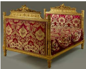
Claude-Nicolas Ledoux, French, 1772 Pelham