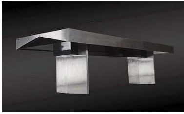
Mechanically operated table with black lacquered interior, 1960s, Müllendorff

Specialists in twentieth century works, Müllendorff bring a unique and very rare steel table, mechanically operated and with black lacquer interior. Designed by the 1960s Italian artist, architect and muse Gabriella Crespi, her works are heavily influenced by artists such as Frank Lloyd Wright and Le Corbusier.