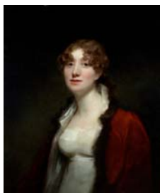
Maria Sophia Abercromby, Raeburn, c1811, Strachan Fine Art