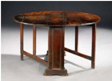
Cromwellian oak table, early 17 th century

Beedham Antiques is displaying a rare set of six English Baroque wall plaques of Old Testament scenes commissioned for Wynnstay House, Denbyshire c1759.