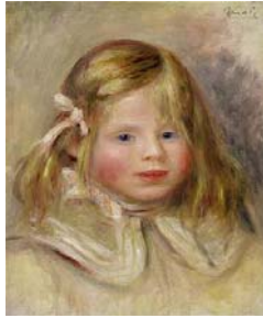
Coco Au Ruban Rose, Renoir, 1905 Trinity Fine Art