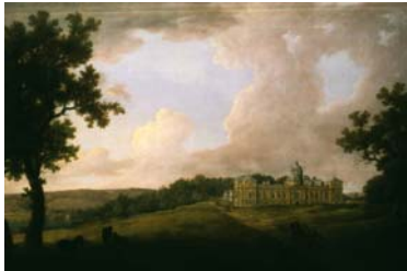
A View of Castle Howard, the West Front by William Marlow, c. 1770 Castle Howard

In an exciting development, Olympia is privileged to hold a loan exhibition from Castle Howard , home to the Howard family for ten generations and over three centuries. A range of paintings including views of Castle Howard by English painter William Marlow; a selection of classical sculpture; and collection of George I gilt wood furniture will all provide an extraordinary chance for visitors to Olympia to witness the fascinating collection Castle Howard enjoys.