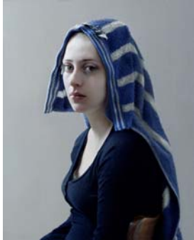
Wet Towel, 2008, Hendrik Kerstens, Witzenhausen Gallery

In a new move for Olympia, photography has its own exhibition space within the fair for the very first time. Visitors will be able to view, and purchase, images from a range of world renowned international galleries.