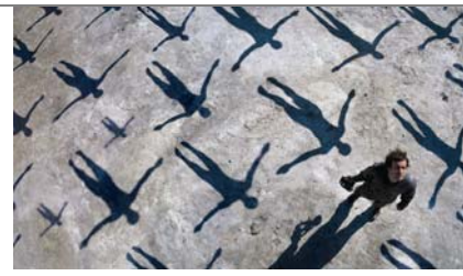
© Storm Thorgerson, Muse: Absolution

A career-spanning retrospective of arguably the most influential and prolific designer of rock music imagery, photography & iconography. From Pink Floyd to Led Zeppelin to the Cranberries , taking in everything from Genesis to AC/DC in between. As well as a look back on Storm's unmistakable contributions to both visual art and music in the last few decades, the exhibition will feature new politically motivated, ambitious site specific works addressing issues of the modern day.