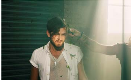
© Gavin Bond, Kings of Leon

Gavin Bond is one of the UK's most successful contemporary photographers having shot highly intimate and exciting images of many of the last decade's most celebrated icons. From phenomenal front covers for leading music magazine Q and fashion magazine GQ , through arresting imagery for hit HBO dramas , to behind-the-scenes reportage of catwalk shows and concerts around the globe, Bond's work has captured the hip zeitgeist of the Noughties.