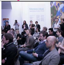
Canvas 8 event at Idea Generation

The gallery space has been used for many quirky and successful events and exhibitions in the past. If you require a venue in which to hold a launch party, talk, screening or networking event, we have the perfect space, facilities and expertise to put in place for you. We offer flexibility, affordability and of course the unusual opportunity to host your event amongst art.