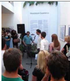
Branchage International Film Festival Launch at IG