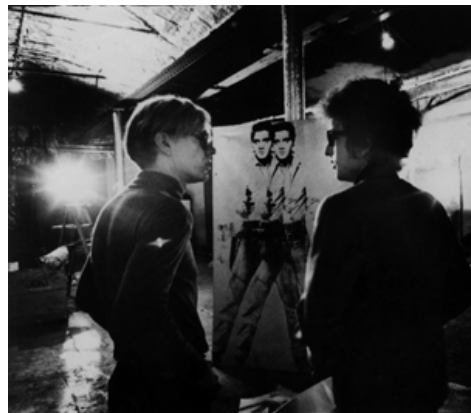
© Nat Finkelstein – Andy, Bobby and Elvis 1965