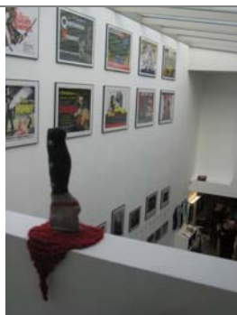
The Hammer Festival installed